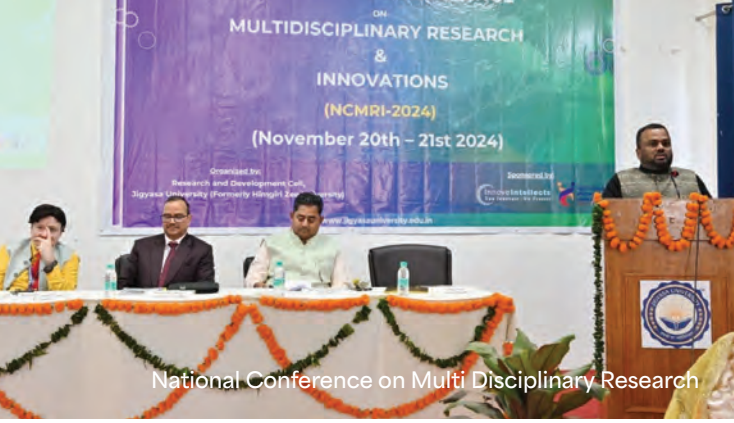
National Conference on Multi Disciplinary Research