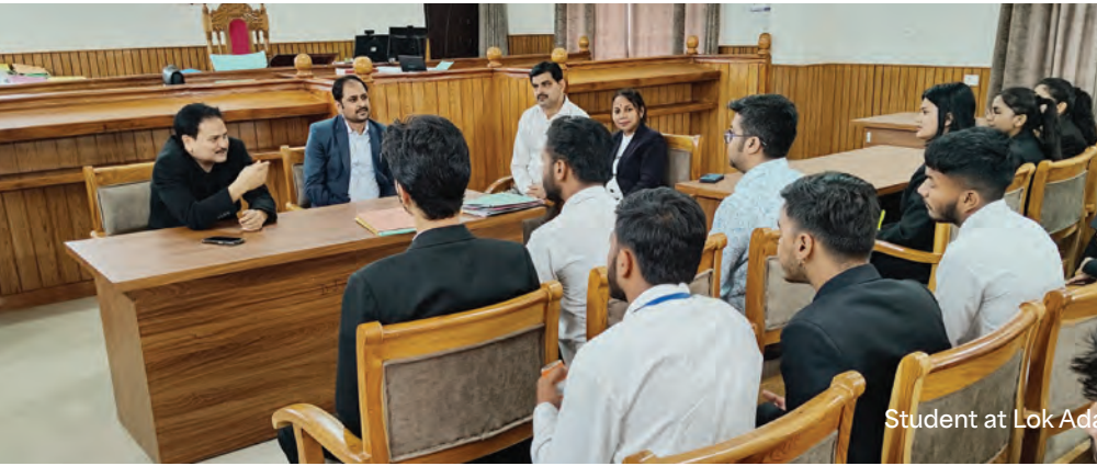
Student at Lok Adalat